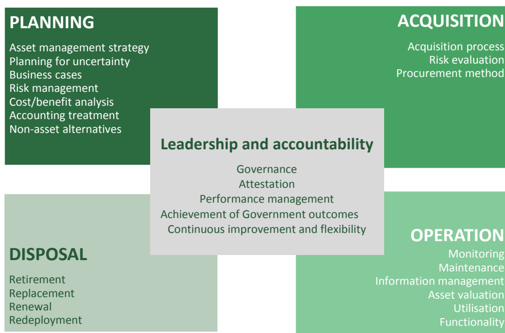
Figure 4: The AMAF asset lifecycle

In addition to overarching leadership and accountability elements, the stages through which an asset generally passes during its life are the: